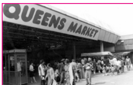
Queens Market, August 1984. Image courtesy of Newham Archives and Local Studies Library