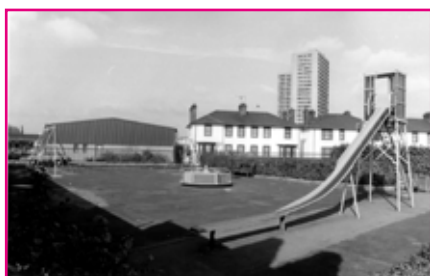
Lyle Park, October 1986.