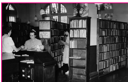
Manor Park Library—interior. 1946.