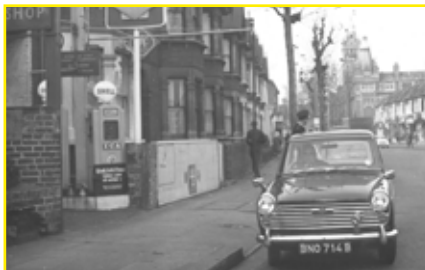
High Street South, East Ham, 1966