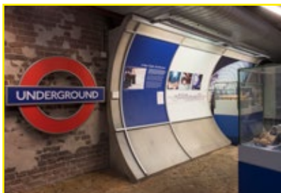
Reconstructed underground station