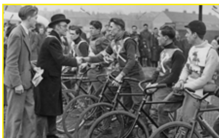
All London Cycle Speedway Grand Prix at Stratford. Mar 1949.