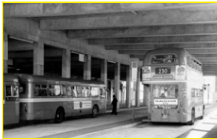
Stratford Bus Station. 16 June 1973