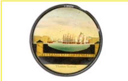
Commemorative snuffbox showing the Thames tunnel